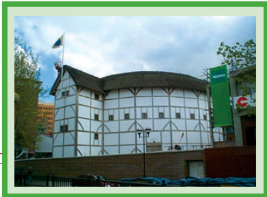
Shakespeare's Globe Theater