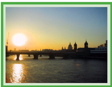
Thames at Sunset

There is more to London than Big Ben, beefeaters and red buses! The city offers a rich tapestry of the arts, which has served as a major catalyst for revitalization and transformation of this timeless metropolis. With London as our example, the International Council of Fine Arts Deans along with the European League of Institutes of the Arts have planned a special and exciting symposium that will explore the many ways cities and their environs are changing through the arts. We hope you will consider being a part of this intense but creative experience that is designed to renew and recharge your energies as an arts leader.